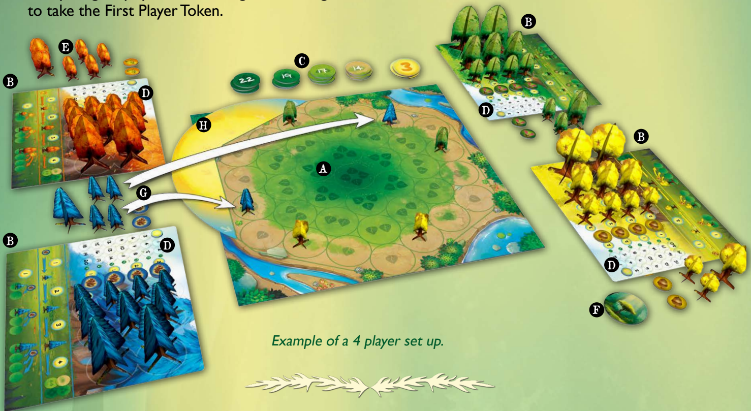
Example of a 4 player set up.

2 player game: Leave the 3 darkest green Scoring Tokens that have 4 leaves printed on them in the box, they will not be used. When players collect Scoring Tokens from the middle 4 leaf space, they instead take the tokens from the 3 leaf stack.